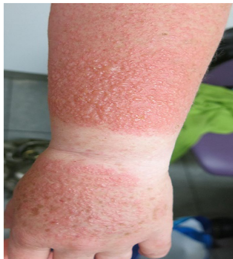
Fig. 5 Systemic photosensitivity from fenofibrate (arm, wrist) following ketoprofen photo-sensitization