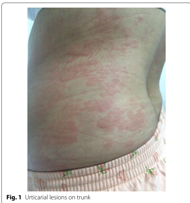
Fig. 1 Urticarial lesions on trunk

Background: Bupropion is a new-generation antidepressant, while its sustained release (SR) formulation is used in smoking cessation for a long time successfully. Urticaria, pruritus and rashes can be seen in 1–4 % of the patients and anaphylactoid reactions like angioedema and dyspnea can be seen in 0.1–0.3 % of the patients using bupropion. We wanted to report a case with urticaria and angioedema due to SR bupropion treatment.